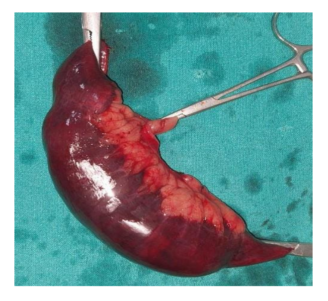
Fig.5 Necrotised intestinal part with foreign body

Fig.4 Photograph showing loop with retrieved foreign body through enterectomy