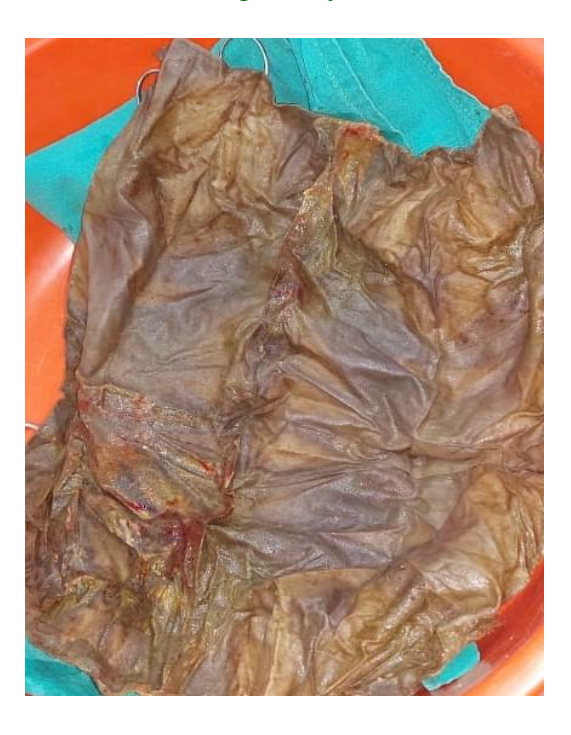
Fig.6 The retrieved foreign body was found to be a cloth